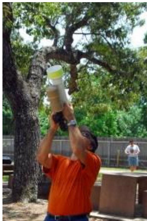
Watch out for low flying aircraft!

and South Gessner for a pre meeting dinner. Story telling and eating will begin between 5:30 and 6:00 PM. Visitors are always welcome.